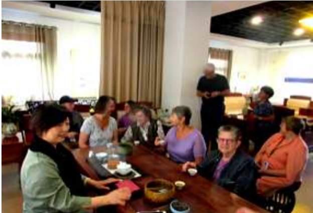
Tea time with the group