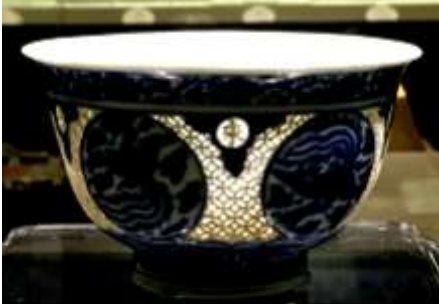
Delicately carved pot