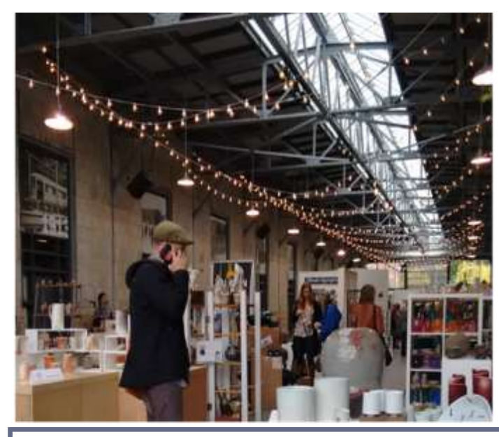
Looking down the length of Wychwood Barns

Four members of the LPG participated in the Clay and Glass Show in Toronto last month. It was my first time visiting the show and I was very impressed. Quite different from our Show and Sales in that each participant had to provide their own booth display and thus there was a wide variety of styles and set up. Also different was the fact that of all applicants, only about 40 were juried into the show. I did get to see Michelle Mendlowicz, our April external workshop presenter and her display as well as the display of some of our past workshop presenters such as Leslie McInally.