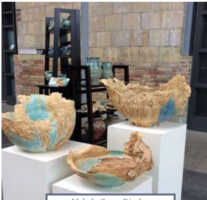
Melody Green Display