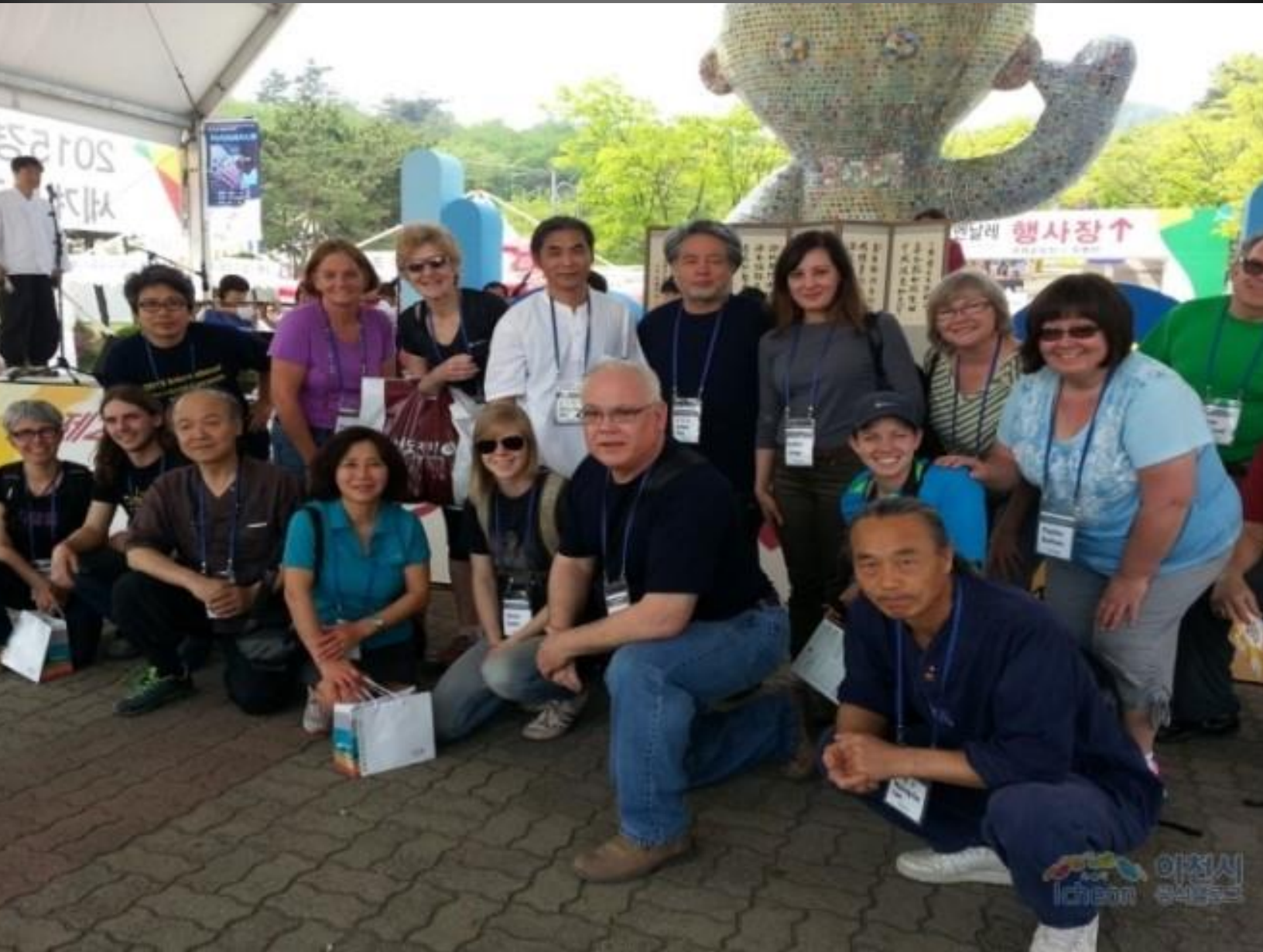
Above: Canadian Potters with the Korean Masters in front of the TOYO Mascot