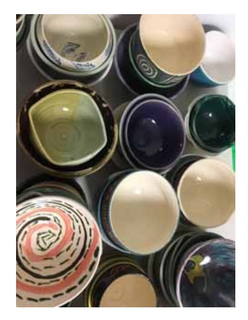
A few of the 700 donated bowls for Empty Bowls 2017