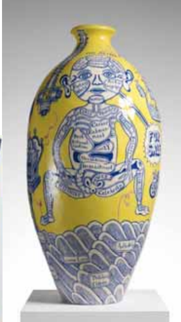
the Rosetta vase - 2011